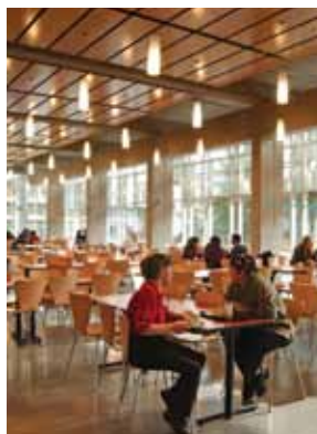
RESIDENCE DINING HALL