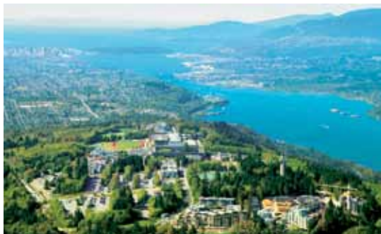
BURNABY CAMPUS, LOOKING TOWARD VANCOUVER

Designed to meet the needs of first-year students, The Towers on Burnaby campus provide safe and comfortable accommodation in about 700 furnished single rooms, each with its own fridge, cable service and high-speed internet. We give priority access to all new full-time international undergraduate scholarship students who meet applicable deadlines: apply online at students.sfu.ca/residences , before February 28.